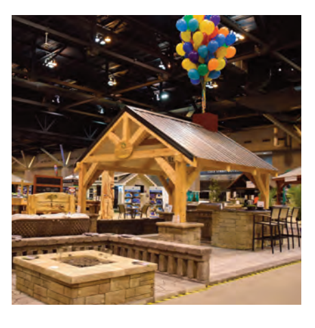
Backyard Giveaway Show visitors registered to win a swingset